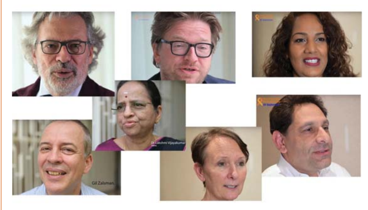
'In Conversation With...

The reach of the social media campaign is the largest to date. World Suicide Prevention Day 2019 was a great success and collaborations with other international organisations has played a central role in this. We look forward to continuing and strengthening our relationships in future years. This series was sponsored by Lundbeck.